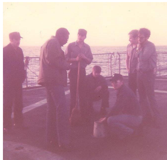
Sea Bats on Fantail 1976