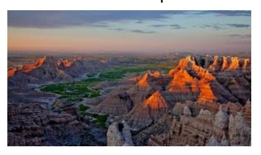
<u>Thursday June 6, 2019</u> 8:45 am – 3:15 pm

Tour #2 Badlands Tour $45 (Includes transportation and admission)